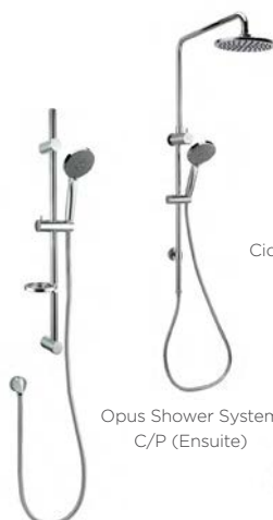
Opus Shower System C/P (Ensuite)