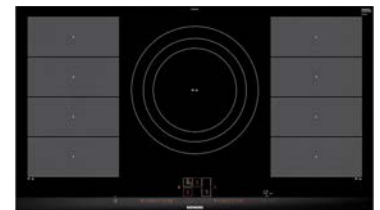
Siemens 90cm Induction Cooktop