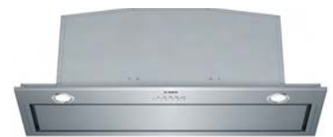
Siemens Undermount Rangehood