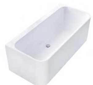
1500 Soprano Wall Faced Bath