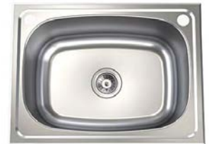
45 Lt stainless Steel Tub/Laundry