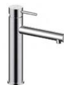
Cioso Mid-rise Vessel Mixer