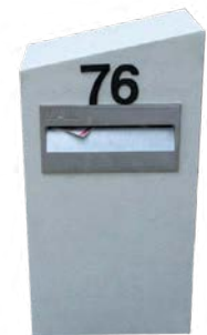
Bahama Rendered Letter Box