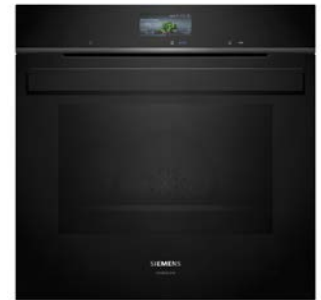
Siemens Studioline 60cm Oven