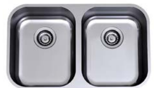
Princess Undermount Double Bowl Sink