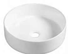
Opus Counter Top Basin