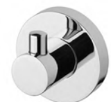
Radii Robe Hook Rnd Plate