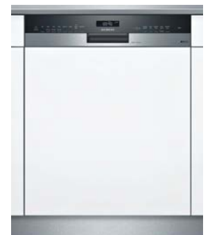
Siemens Semi intergrated Dishwasher