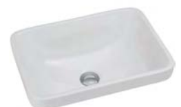
Fienza Sarah Inset Basin