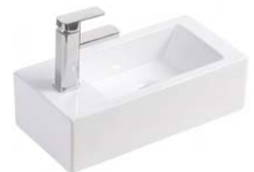
Fienza Linea Wall Basin