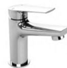
Arlo Basin Mixer C/P