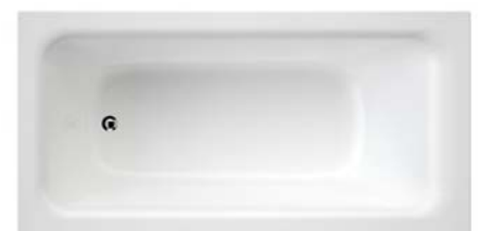
Viva 1525 Island Mount Bath