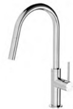
Vivid Slimline Pull-Out Mixer