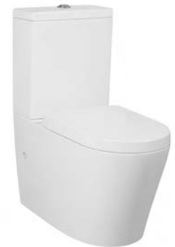
Kore Plus BTW Suite