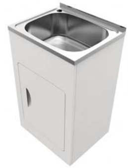
Kore Laundry Tub & Cabinet