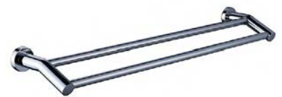
Kore Double Towel Rail