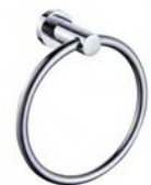
Kore Towel Ring