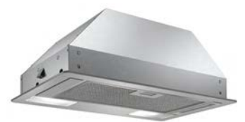
BOSCH 60cm Undermount Rangehood