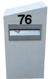
Bahama Rendered Letter Box