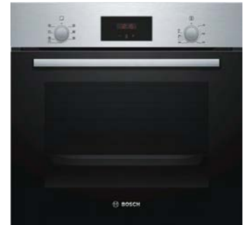
BOSCH 60cm Oven