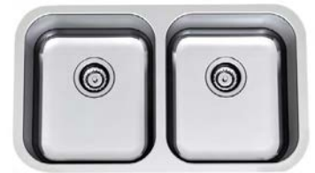
Princess Over Mount Double Bowl Sink