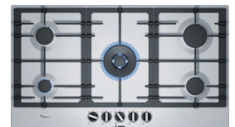
BOSCH 90cm Gas Cooktop