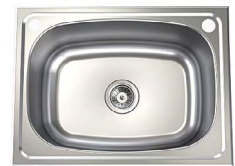
45 Lt stainless Steel Tub