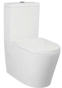
Kore Plus BTW Suite