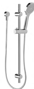
Teva Rail Shower C/P