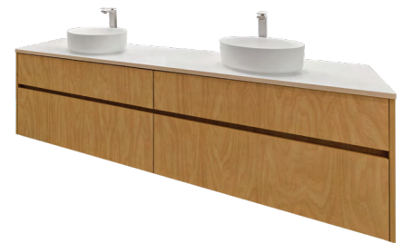
Custom made in your choice of laminate colour