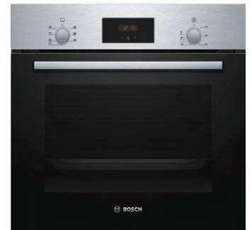
BOSCH 60cm Oven WTFT Display