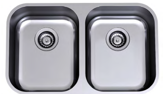
Monaco Undermount Double Bowl Sink