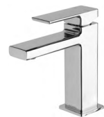
Ratii Basin Mixer C/P