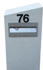
Bahama Rendered Letter Box