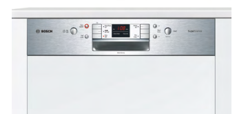
BOSCH Semi-integrated Dishwasher