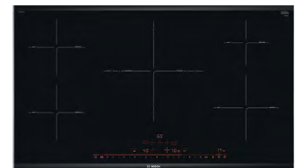
BOSCH 90cm Induction Cooktop