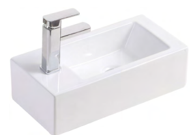
Fienza Linea Wall Basin