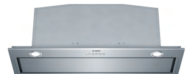
BOSCH 90cm Undermount Rangehood